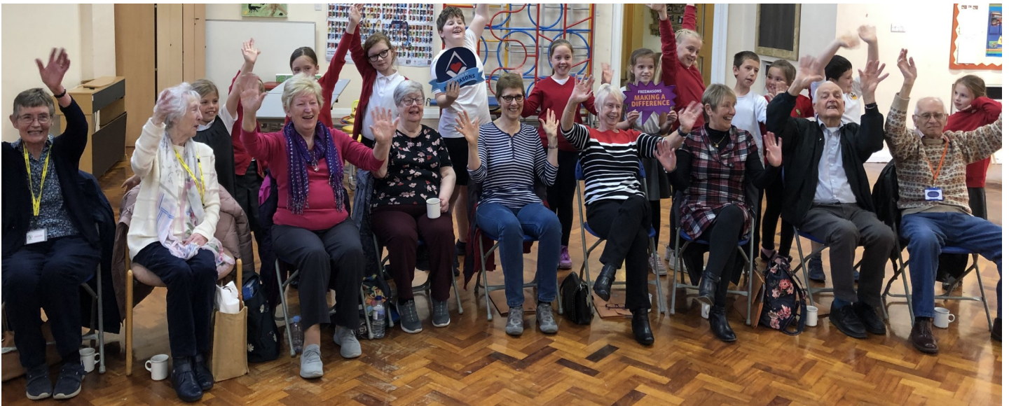
The BG Choir welcomed members of our local community for our first choir practice. We will be working hard to perfect the songs ready for a Christmas performance on the 18th December. We hope you all can join us for this exciting event.