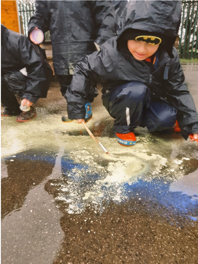
Spilsh! Splash! Splosh! Fox Cubs have had a wonderful time jumping in puddles and then investigating what happens when colour is added.