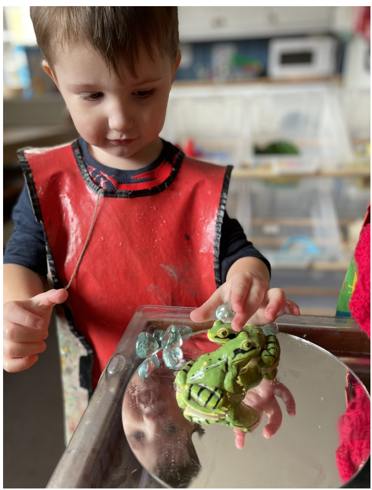
Fox Cubs enjoyed frogs in the water tray before visiting Forest School to find real frogs.